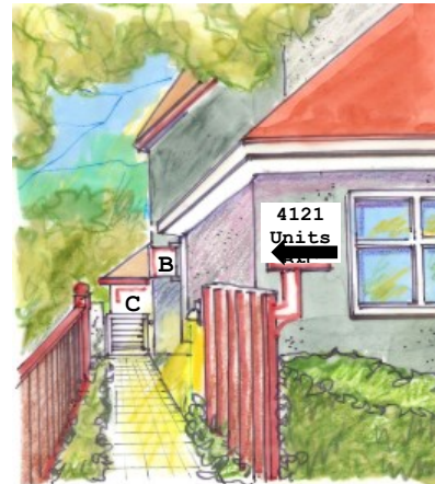
Figure 8.5 Down-lights & signs at access path to units