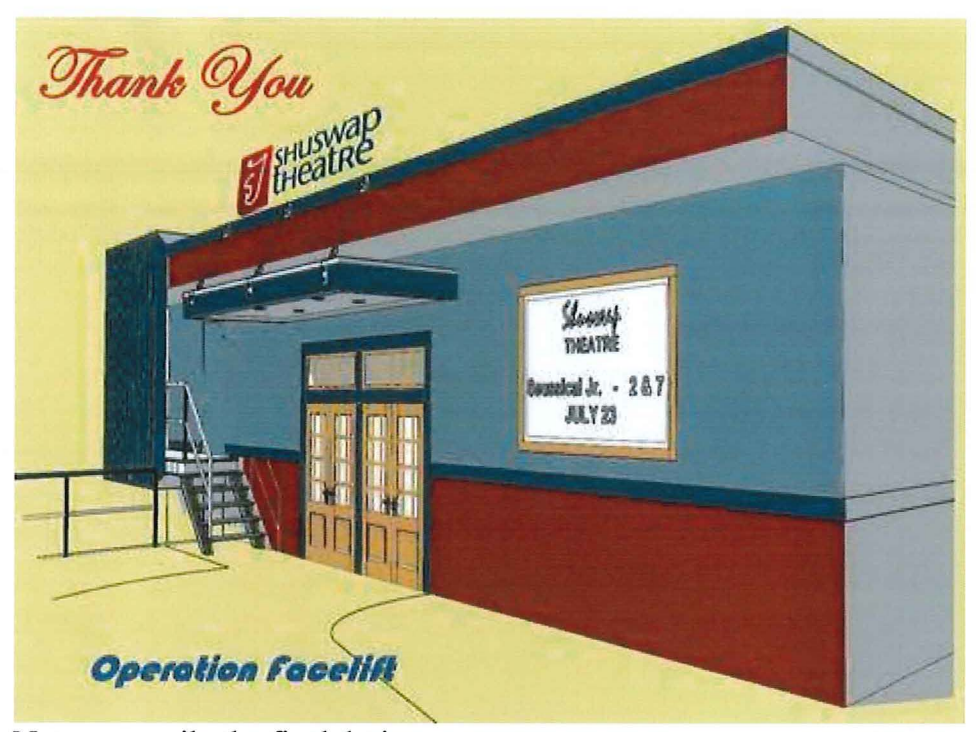
Not necessarily the final design